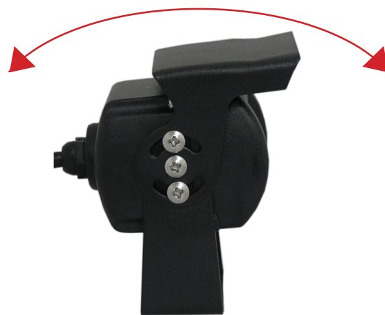
TILT VISOR FEATURE