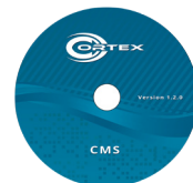
Free CMS software

Designed with expandability in mind, the HYBIX series will also integrate with NVR and IP products for a complete solution. Coming soon!